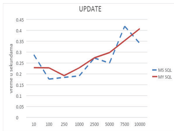
Figure 2: Results of measuring UPDATE records in the table (in seconds)

Although the speed of UPDATE is almost linear in My SQL, we see that there are deviations in MS SQL. The amount of data that is sent by the server to the client is small, i.e., it contains information about the elapsed times in the measuring points. These deviations are consequences not only to the time required to process the data on the foreign SQL server, but also to the processed results to