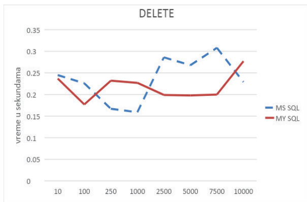
Figure 3: Results of measuring DELETE records from the table (in seconds)

Graphical interpretation is provided in Figure 3.