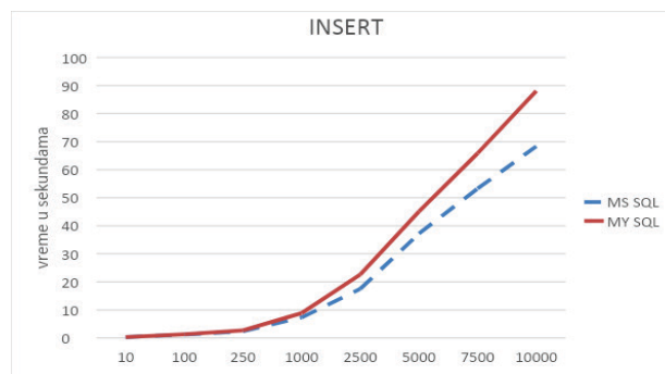
Figure 1: Results of measuring INSERT records in a table (in seconds)

Figure 1 shows that the advantage in the speed of INSERT records is on the MS SQL side over MY SQL, when increasing the number of records to be written to the table.